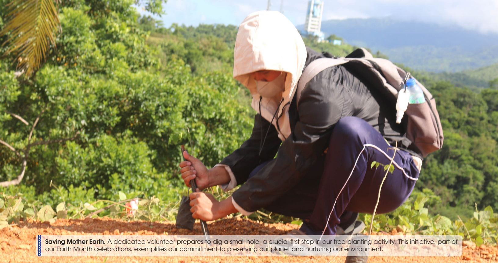
Saving Mother Earth. A dedicated volunteer prepares to dig a small hole, a crucial first step in our tree-planting activity. This initiative, part of our Earth Month celebrations, exemplifies our commitment to preserving our planet and nurturing our environment.